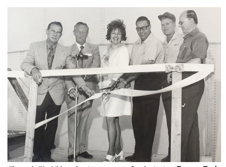
The early 70s Ribbon Cutting ceremony for the Juniper Terrace Tank.

For the past five decades, the SVGID has been delivering quality drinking water to the Sun Valley community.