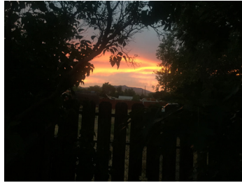
2nd Place Sherry Armenta