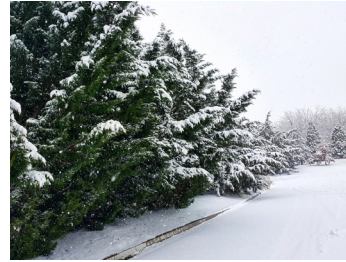
3rd Place Gustavo Gomez

The following local residents are the 2017 winners of the District's annual photo contest.