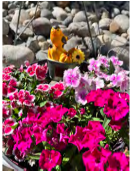
1st Place: Alta Ellis